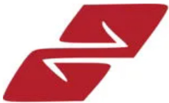
Metro Railway, Kolkata

Kolkata's Metro system hit a new high on December 10th, recording its highest single-day ridership ever. This surge in commuters signals a rising tide of public transport adoption in the city, with residents embracing the convenience and efficiency of the subterranean network. As Kolkata's urban landscape expands, the Metro's role in shaping sustainable and efficient mobility seems poised to grow even more prominent.